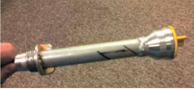
A Meeting Mystery