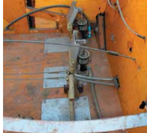
Last month's Mystery Jodel rudder pedals and brakes