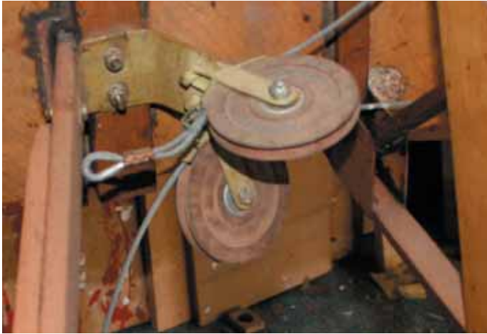
A garage Mystery