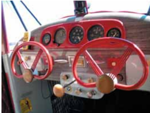
Cliff Cole provided this mystery photo