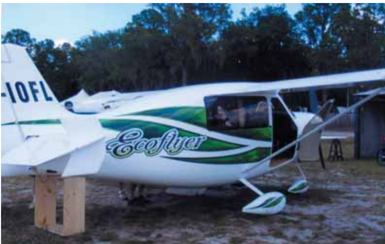
Ecoflyer - A light sport/utility plane with room for camping. Unfortunately this plane was destroyed in a crash after Sun 'n Fun