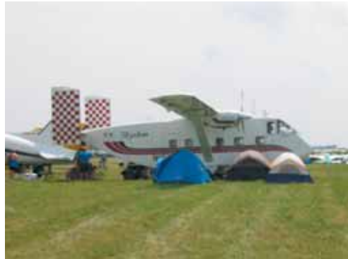
I think this is a Shorts Skyvan