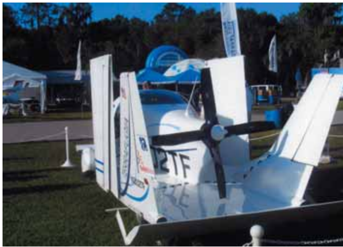
TerraFugia - a roadible aircraft design that recently made it's first flight