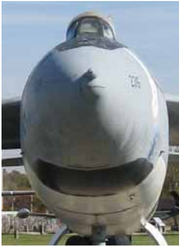
This months Mystery Plane is in Indiana