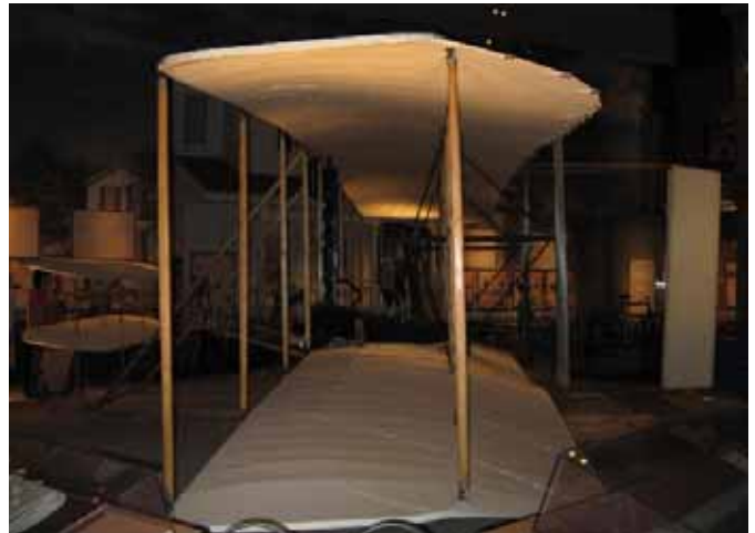
Last month's Mystery was the Wright Flyer