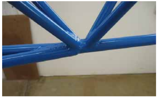
One month later...