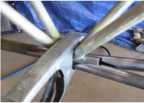
Last month's Mystery was a cluster to tubes on the Eaglet fuselage