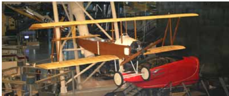
Another mystery from the Smithsonian