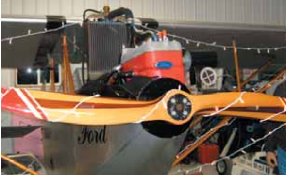
A festive engine at the party