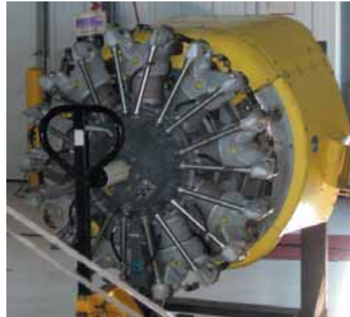
Last months mystery was a test stand engine used for propeller tests. Engine folks, is this a Pratt R985?