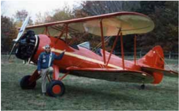
Last month's Mystery Phil Michmerhuizens Waco UPF-7