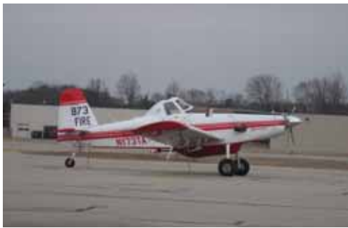
This months Mystery Plane was at Grand Haven