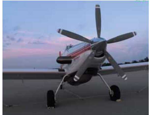
Last month's Mystery was an Air Tractor AT-802A