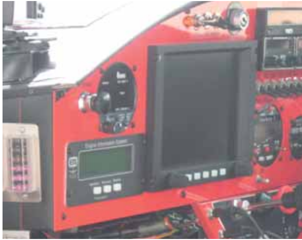
This month's Mystery Plane was a guest at Grand Haven