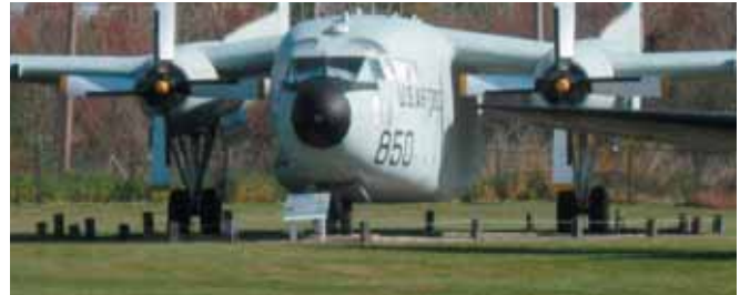
Last month's Mystery was a Fairchild C-119G at Grissom Air Museum in Indiana