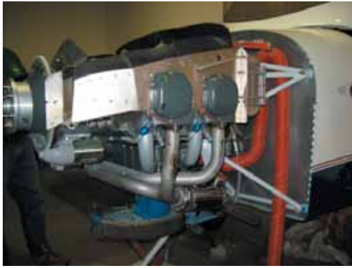
This month's Mystery Plane is at Park Township