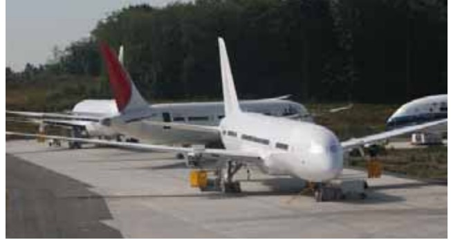
Last month's Mystery was a Boeing 787 with a weight where the engine belongst