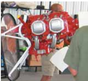
A mystery in Spartat