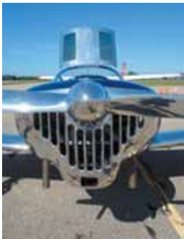
Last months Mystery - A Swift