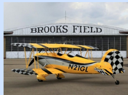
Great Lakes 2T-1A

In March 1986, the first WACO YMF Classic rolled off the assembly line and received FAA certification under the original WACO type certificate. With more than 5000 labor hours of fine craftsmanship hand-built into each aircraft, it's no wonder the WACO YMF was hailed as an aeronautic thoroughbred. This unique biplane was not a rebuild or a kit plane, but a brand new FAA certified production aircraft, with such improvements as the use of sturdy 4130 steel for the fuselage frame, modern hydraulic toe brakes and advanced avionics.