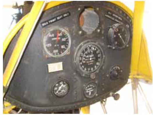
Last month's Mystery was the panel of the Eaglet