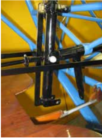
An Eaglet Mystery Part