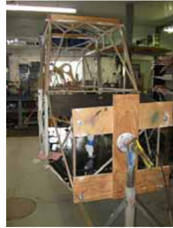
This mystery is a Champ