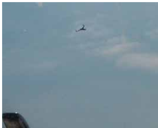
How many of you saw Paul Overbeeks Long-EZ in last months photo?