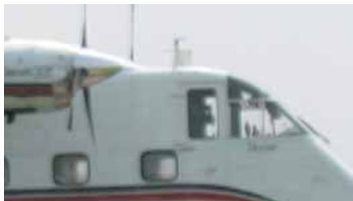
A 2003 Mystery