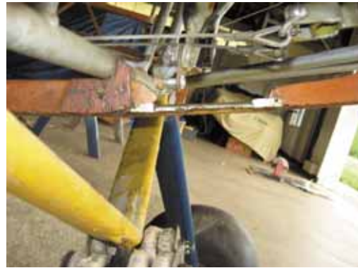
Last month's Mystery was under the engine on the Eaglet