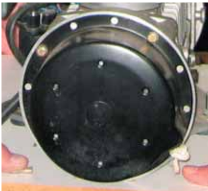
A Meeting Mystery