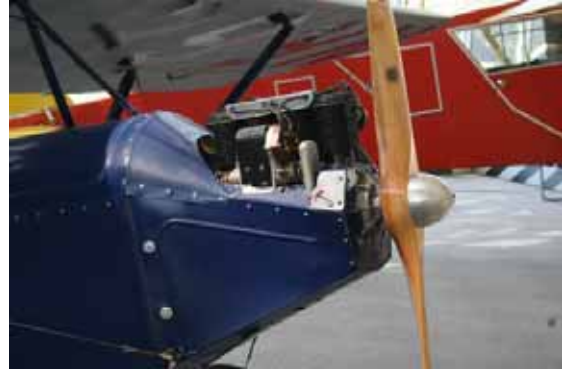
Last month's Mystery was a Model V Heath Parasol