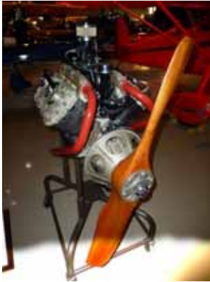
Another engine Mystery