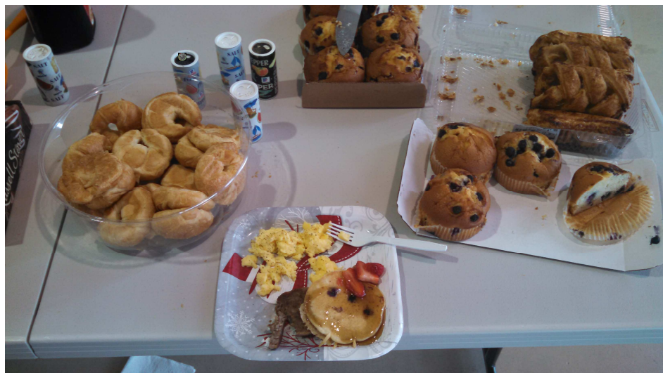
Join Us for a Holiday Breakfast This Saturday, Dec 11

Editor's Report & Chapter Info Board of Directors Addresses 5