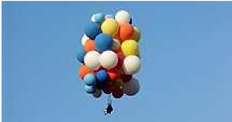
Cluster ballooning is said to have been inspired by Larry Walters's experience, although Walters was not the first to perform such a feat.

On July 2, 1982, Larry Walters (April 19, 1949 – October 6, 1993) made a 45-minute flight in a homemade airship made of an ordinary patio chair and 45 helium-filled weather balloons. The aircraft rose to an altitude of about 16,000 feet (4,900 m), drifted from the point of liftoff in San Pedro, California, and entered controlled airspace near Long Beach Airport. During the landing, the aircraft became entangled in power lines, but Walters was able to climb down safely. The flight attracted worldwide media attention and inspired a movie and imitators.