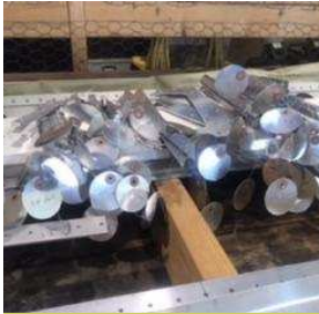
CRAIG BUTTERY BEARHAWK

Disassembled the spar [of the Bearhawk] and de-burred about 1750 holes. I don't remember so many holes on the rear spars. Next is to strip, alodine and prime these parts .