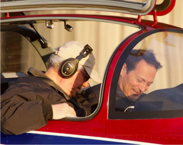
All smiles upon arrival to 6b6 Minute Man Air Field!