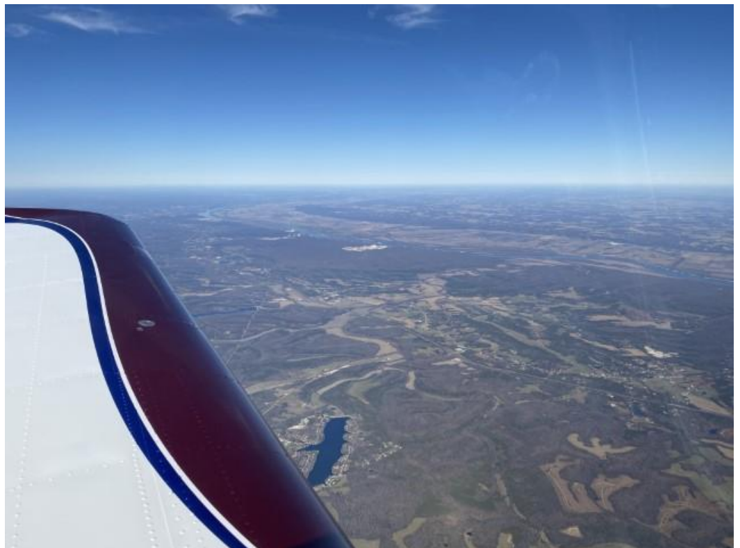
The mighty Mississippi River!