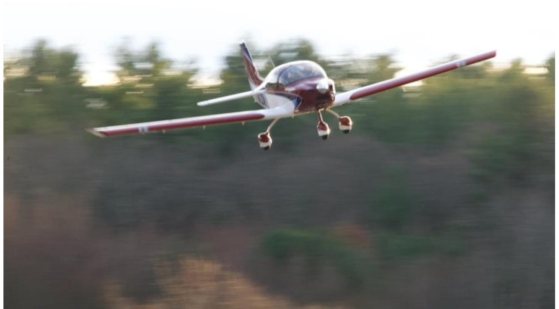
Fly by into 6B6 after their non-stop from Dayton!