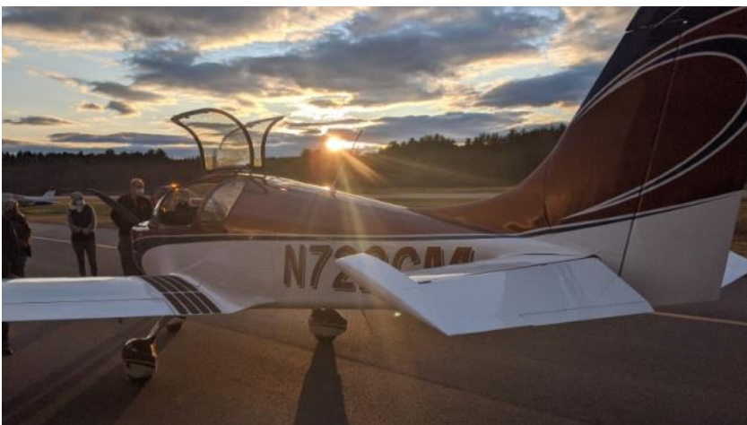
A beautiful sunset after a great day!