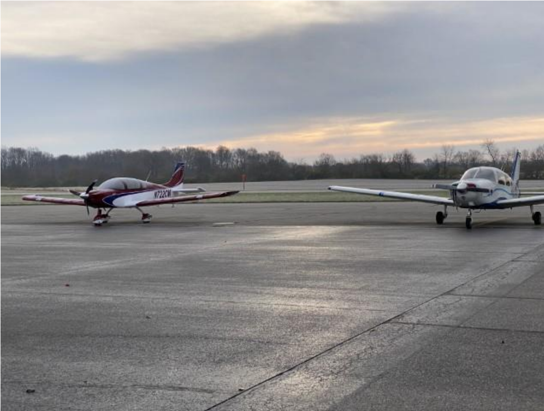
On the ground in Dayton, OH for their overnight stay.