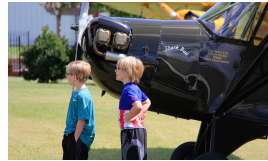
WATCHING THE ACTION KIDS AND AIRPLANES