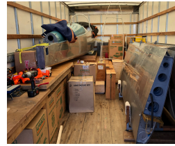
TIME TO MOVE!