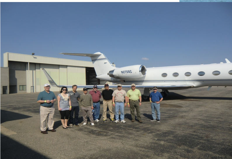
March Fly Out to Kalamo!