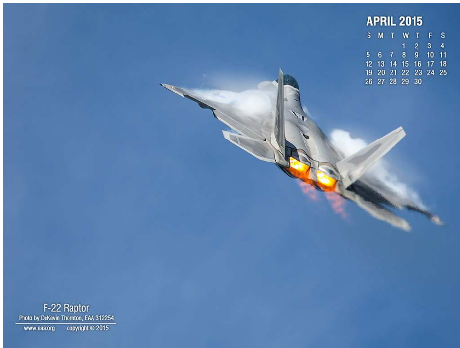
F-22 Raptor