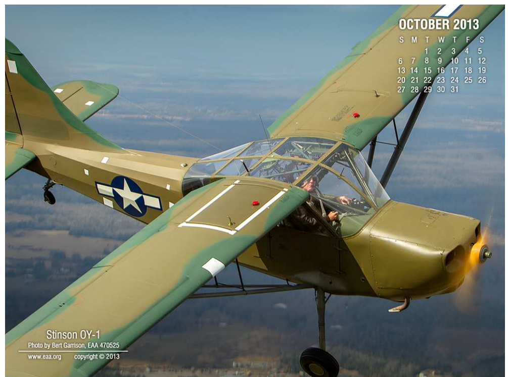
Stinson OY-1