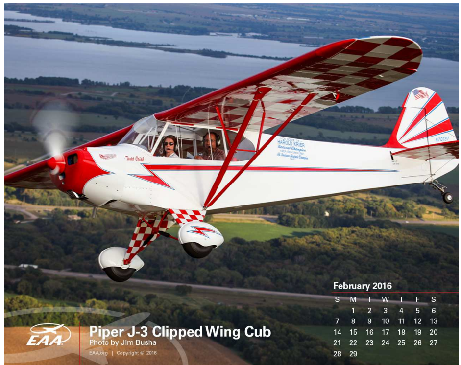
Piper J-3 Clipped Wing Cub