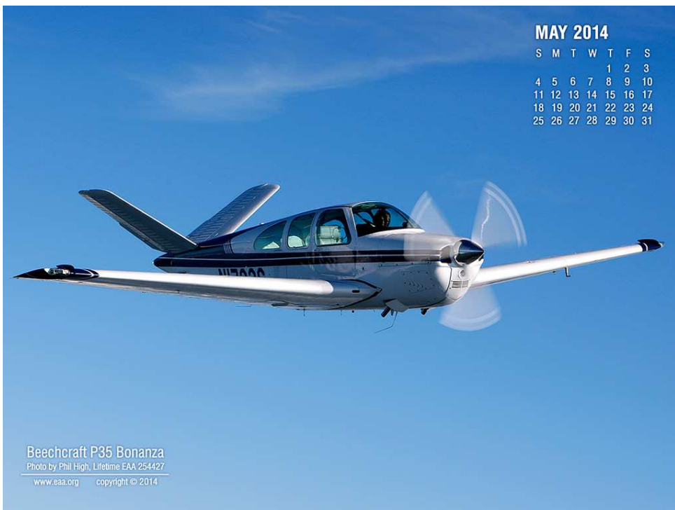
Beechcraft P35 Bonanza