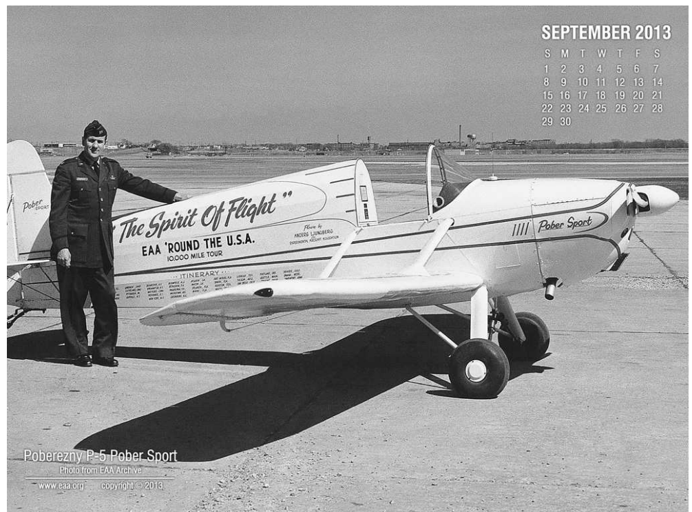
Poberezny P-5 Pobere Sport