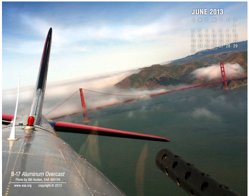
B-17 Aluminum Overcast