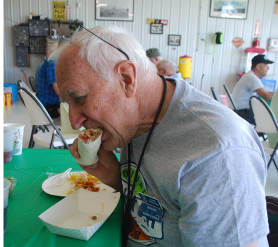
That's all there is.....