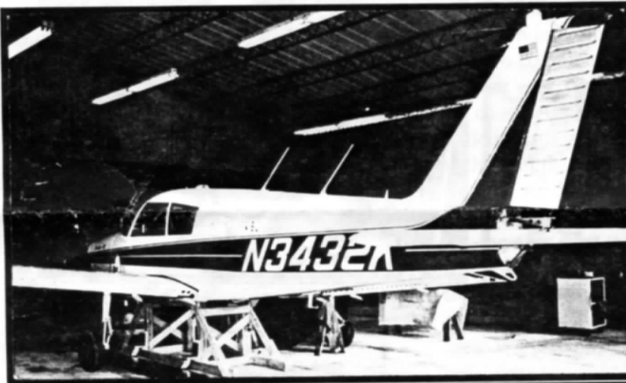
Left wing assembled to fuselage. Notice the wheels have also been reassembled

The wings were shipped to a repair facility located in Kendallville, IN called Williams Airmotive. They specialize in yellow-tagged repair of Cessna and Piper components. (Bill has the brochure if you'd like to see it) He built a "coffin" 14' long by 6' high by 2' wide with the idea that if the wings couldn't be fixed, at least he could give them a decent burial. Williams Airmotive drilled out the rivets, removed the ribs, replaced the infected spar, reassembled and had both wings back to Reliable within a month. Now the simple (??) task of getting everything back together. With the help of chapter member, Woody Treon, the wings are back on and Bill is finishing up some other minor repairs. Scheduled completion date is January 2000. Blue skies Bill and Woody!