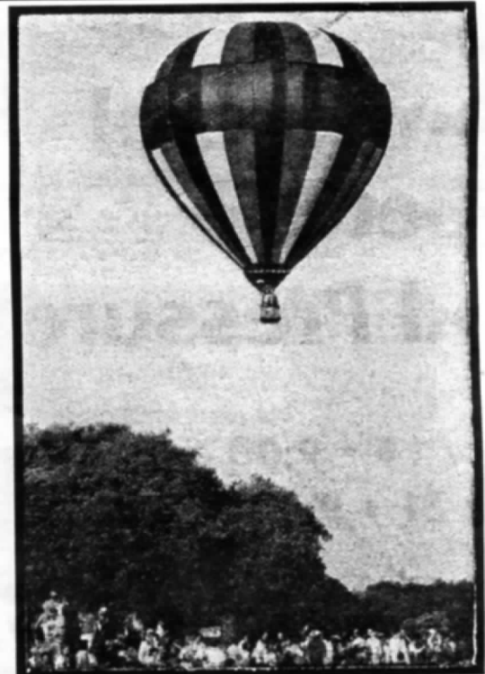
This year the Brandon Balloon Classic is moved to Vandenberg Airport.

Ground level activities will be coordinated by EventMakers, a Tampa-based professional event organizer that also produces the Southwest Airlines Gasparilla Parade