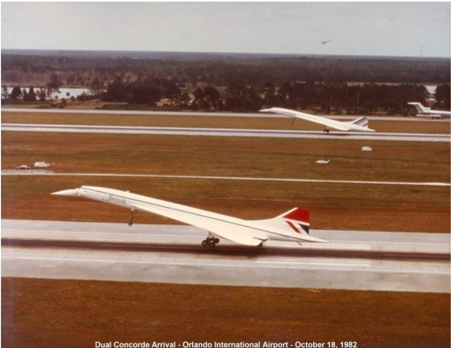
Dual Concorde Arrival - Orlando International Airport - October 18, 1982

A Disney promotion – it never made money, but we all miss the Concorde, don't we?