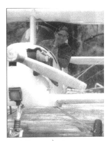
ELFLINT & SCAMP