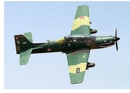
[description courtesy of Wikipedia]

The mystery aircraft to the left is an Embraer EMB312 Tucano , a single turbo-prop aircraft with counter-insurgency capability, developed in Brazil. Design work began in 1979 and the prototype first flew in 1980. An improved variant known as the Short Tucano was license-produced in the United Kingdom. The Tucano made inroads into the military trainer arena and became one of Embraer's first international marketing successes. A total of 664 units were produced (504 by Embraer and 160 by Short Brothers), flying in 16 air forces over five continents.