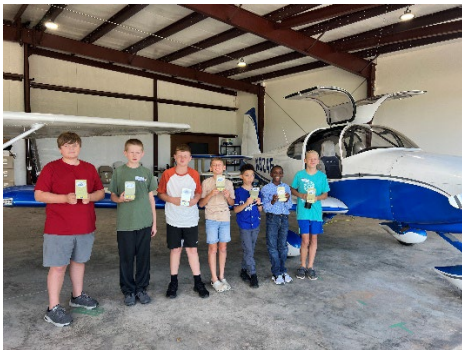
Young Eagles display their newly made cell-phone holders

Our EAA Young Eagles Workshop program took place on 3 consecutive Saturdays in August. More than 24 kids aged between 11 and 17, learned about 9 aviation subjects and had a close-up, hands-on look, into the world of aviation. The learning modules were about Airplanes, Aerodynamics of Flight, Aviation Communication, Compass Headings, Flight Instruments, Pilotage & Sectional Charts, Weather Basics, Traffic Patterns and Aircraft Building. These subjects were divided into 3 modules/day with presentations and various tasks such as reading aviation sectional charts, memorizing the phonetic alphabet, interpretation of flight instruments, worksheets and hands-on activities. The fun, interactive experiences varied from flying in a real Flight Simulator, to practicing a few real-world aircraft building techniques and skills including riveting work and sheet metal bending. At the end, our youngsters received their Certificates of Completion and their own EAA Young Eagles Workshop Project: a homebuilt aviation sheet metal cell phone holder.