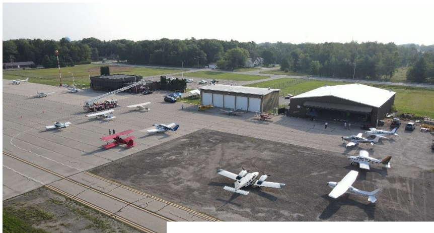
Scenes from Airport Day 2023

Business Meeting, Airport, 5 PM Pancake Supper, 5:30 PM