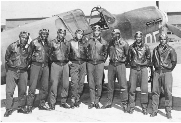
Tuskegee Airmen Display