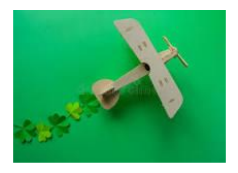
Happy St. Patrick's Day