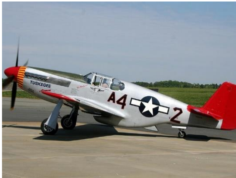
P-51 Mustang "By Request"