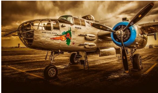
B-25 "Maid in the Shade"