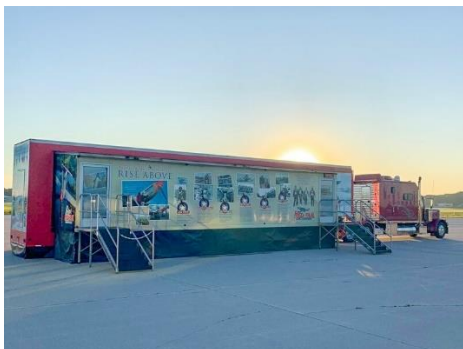
CAF Minnesota Wing Rise Above

Tickets are limited so go to ColumbusAirShow.com to get yours. Remember to purchase your parking pass.