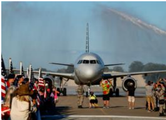
Old Glory Honor Flight

https://www.eaa.org/airventure/features-and-attractions/veterans-activities?utm_source=av_tickets_email8_240519&utm_medium=email&utm_campaign=av_veterans_2024&utm_content=&mkt_tok=OTEwLVNFVS0wNzMAAAGTMI_HVZ1Vg0Yli6q4q3m5o4xRnseEMqSbCRwpBbP3WCQ3-NiP93S8pWVU9U6t-GSgL25Pg5YKTEUTXfOqTHF-b4iFpEMh8ETBCEglgB46g_wRPFs#breakfast