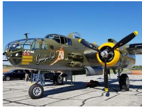
B-25J Mitchell "Georgie's Gal"

Tickets are limited so go to ColumbusAirShow.com to get yours. Remember to purchase your parking pass.