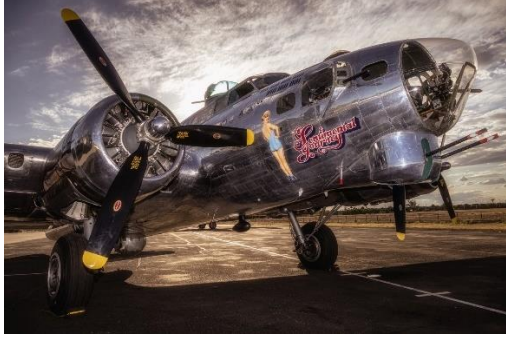
B-17 Flying Fortress Sentimental Journey