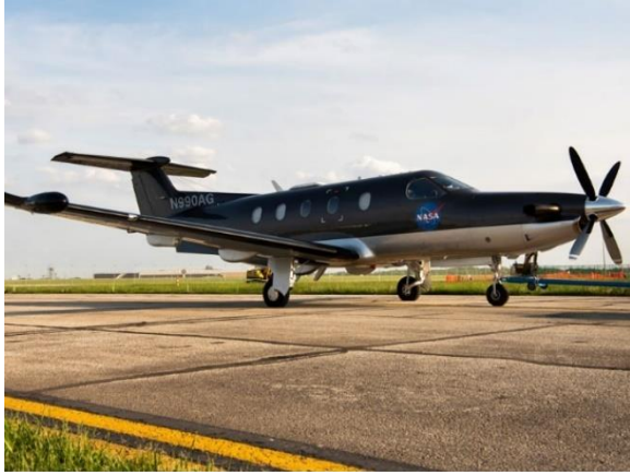
PC-12 + Exhibit - NASA Glenn Research Center