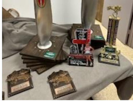
Car trophy & plaques

Also, if you do not have an email address on file to receive the newsletter 'Tailwinds' and would like to, please send me an email at DAFord1957@gmail.com