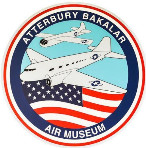
Atterbury-Bakalar Air Museum Complex, Columbus,