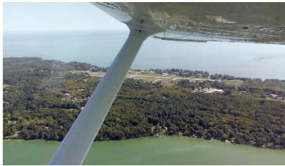
Put-in-Bay Township Port Authority, Put in Bay, OH (3W2)

Clare County Airport 80D, a little north of the center of the Lower Peninsula. Not a $100 hamburger. It's a pasty flight - the biggest and best one you may ever find. Half a pie in size! Fine, inexpensive home cooking ... very clean and hospitable to fliers.