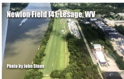
Newlon Field I41, Lesage, WV (I41)

Abrams Municipal Airport - Grand Air Aviation, Grand Ledge, MI (4D0) A sleepy little field located seven Miles west of Lansing Capital City Airport KLAN. Owned by the City of Grand Ledge. Courtesy car available for 2-mile drive to main intersection downtown where there are 3 restaurants.