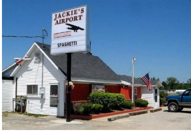
Jackie's Airport Restaurant, Harrison, MI (80D)

Clare County Airport 80D, a little north of the center of the Lower Peninsula. Not a $100 hamburger. It's a pasty flight - the biggest and best one you may ever find. Half a pie in size! Fine, inexpensive home cooking ... very clean and hospitable to fliers.