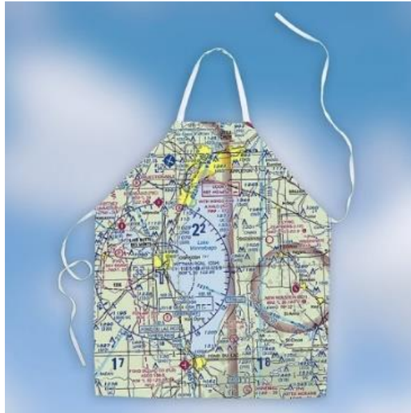
Custom U.S. Aeronautical Chart Apron