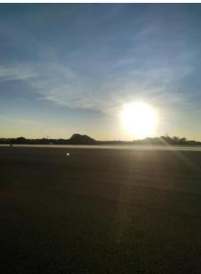
The sunrise on Saturday morning. It was beautiful.