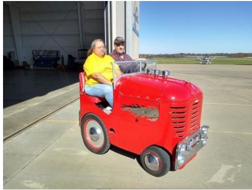
A new toy