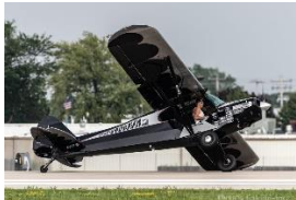
Franklin's Flying Circus