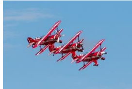
Direct from Canada!