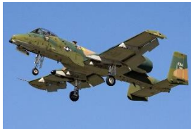
The Hog is Back Baby!