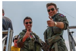
Maverick & Iceman

To learn more and to purchase your tickets and parking ( must be done online ) go to