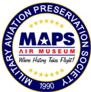
2260 International Parkway North Canton, OH 44720 330-896-6332

First 2022 Get Together – Thursday, Jan 13 Check their website closer to the date for the topic.