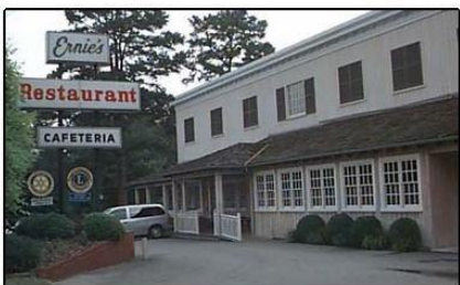
Ernie's Restaurant, South Boston, VA (W78)