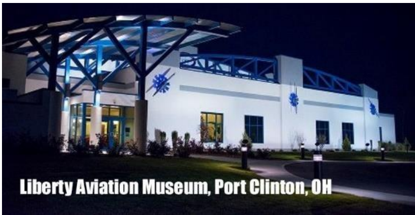
Liberty Aviation Museum, Port

EAA Chapter 2 - Promoting Sport Aviation Since 1956!