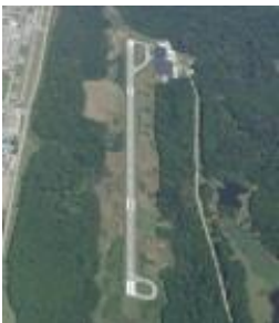
Jackson County Airport, Millwood, WV I18

Champaign Aviation Museum is located on Grimes Field as well as the Grimes Flying Lab the Airport Cafe! What a great way to spend a Saturday checking out history! Fly in or drive in!