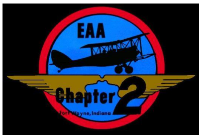
EAA Chapter 2 Fort Wayne, IN

The 2022 scholarships will be awarded during the 33rd Annual International Women in Aviation Conference in Nashville, Tennessee, from March 17-19, 2022.