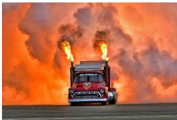
Hot Streak II Jet Truck