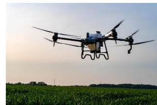
Lake Erie Drone