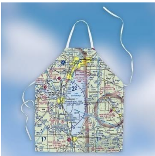
Custom U.S. Aeronautical Chart Apron