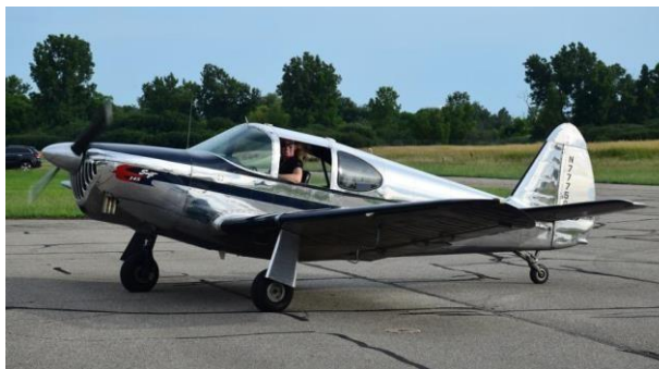
Nelini Faulkner Globe Swift GC-1B 1948